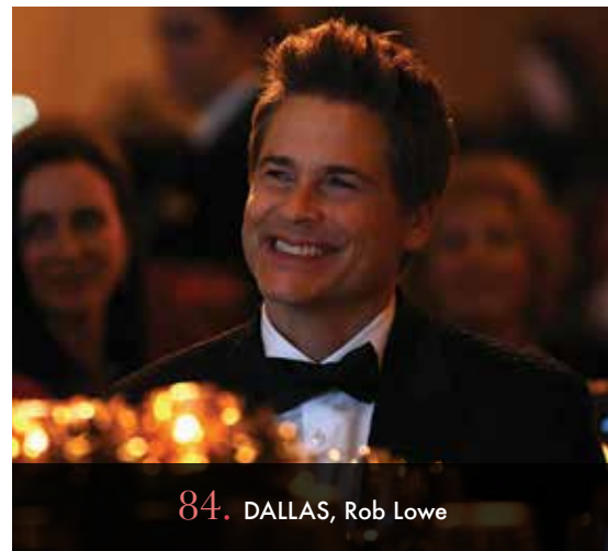
84. DALLAS, Rob Lowe